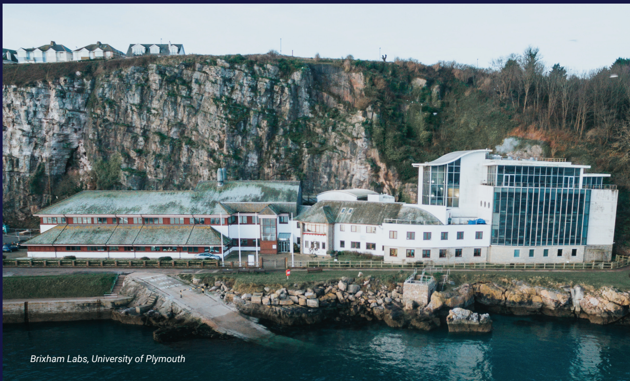
Brixham Labs, University of Plymouth

Twenty-two world-leading research institutions offer expertise, testing facilities and research collaboration opportunities for innovative marine and maritime companies.